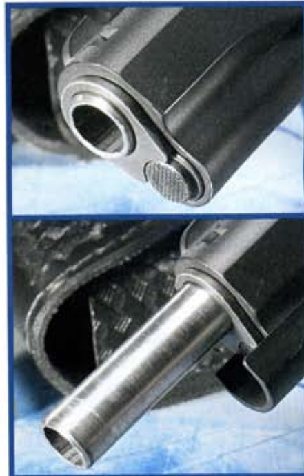
GI Expert has a premium stainless steel barrel and full metal bushing. Note the lack of a full-length guide rod.

with the center measuring just 0.50 of an inch to the right of center. The WinClean earned praise in its ability to punch perfect circles in the target for easy identification. The best group measured a very impressive 1.75 inches center-to-center and held an average of 2.75 inches after a 5-shot group. One aspect that went unappreciated during testing of the Winchester ammunition was the controllability. Follow-up shots were fast and accurate.