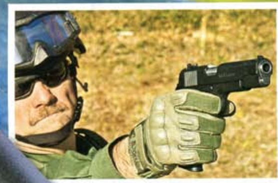
By Eric R. Poole

Modern reflection of what a duty 1911 SHOULD BE – without the overdressed features!